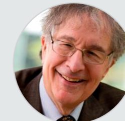
DR. HOWARD GARDNER Harvard Graduate School of Education

"Design for Change (DFC) is one of the most exciting and important educational programs that I know of, with the potential for impact in numerous countries around the globe....Our first wave of studies documents clear improvements in student empathy as well as challenges in enhancing problem solving abilities....DFC provides a valuable model for a wide range of educational innovations".